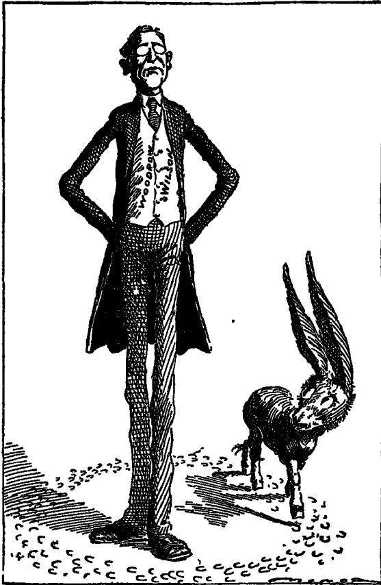
One of the many cartoons of Woodrow Wilson published at the beginning of his political career. This is from the St. Louis Post-Dispatch , December 29, 1910.